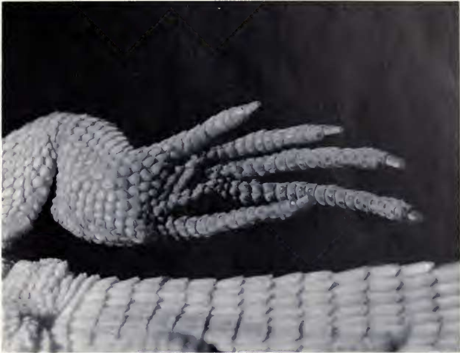
FIG. 3. Ventral view of left hind foot of Varanus acanthurus (mvz 81648), from Charter's Towers, Queensland, Australia. Snout-vent length of the lizard is 123 mm.

exhibit several foot morphologies, but none of them has rows of darkly pigmented, juxtaposed scales as in V. prasinus .